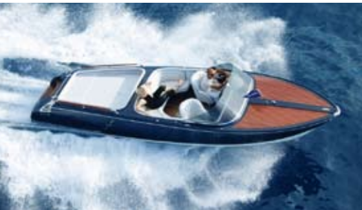
757 St. Tropez

606 RIVIERA length 606 cm, width 220 cm, engine 99-235 kW (gasoline, diesel or hybrid engine), weight starting at 1400 kg