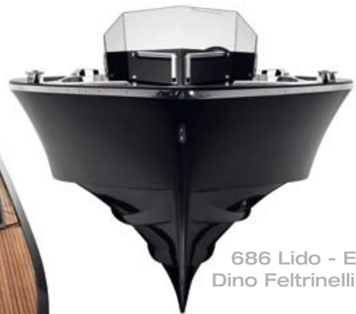
686 Lido - Editione Dino Feltrinelli